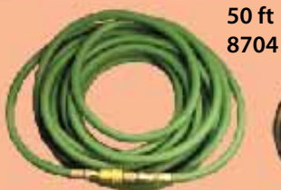
50 ft 8704