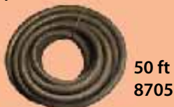
50 ft 8705

NOTE: Requires air compressor not included. Recommended air compressor capable of 8 SCFM